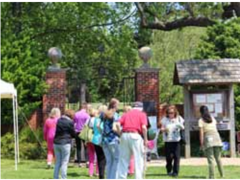
Crowds at Westover Plantation, built by William Byrd II around 1730.