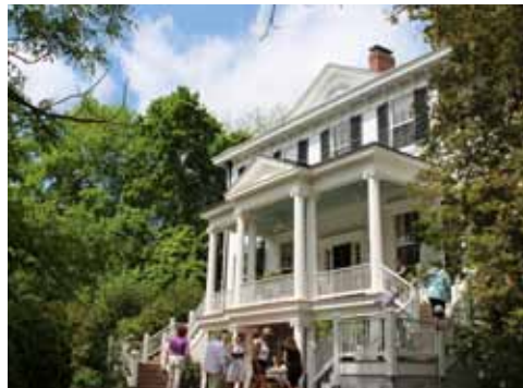
Riverview Farm, a Greek Revival antebellum home built in 1860.

For more than five decades, the partnership with the GCV has endured as the Council has partnered with the four garden clubs in Richmond to host garden tours highlighting historic homes and gardens in the Richmond area. The April 2016 tour highlighted the James River Plantations - a tour anchored in Richmond at Great Shiplock Park, traveling along scenic Route 5 and (for bike enthusiasts) the Capital Trail and featuring eight historic properties and plantations. Proceeds from these tours go toward Historic Richmond's mission work to preserve, protect and promote Richmond's historic buildings, neighborhoods and places.