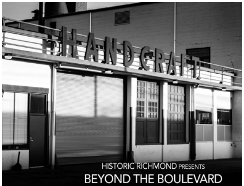
photo credit: Handcraft #5780 by Alex Nyerges, courtesy of Historic Richmond

The images included in our juried photography exhibit and silent auction have been compiled in a publication for the Beyond the Boulevard event. See our website for a preview of the incredible photography that will be up for bid on October 6th!