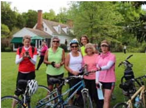
The Capital Trail attracted a large number of bicycle enthusiasts to join the tour at Dogham Farm, patented in 1642.

Founded in 1959, the mission of the Council of Historic Richmond is to support Historic Richmond through a variety of projects and programs. The Council prepares its members to be ambassadors for Historic Richmond through self-enrichment gained from programs, tours, research projects and attendance at educational events sponsored by the Council and Historic Richmond.