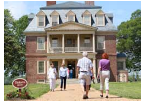
Shirley Plantation, the oldest family owned business in North America, dating to 1638.