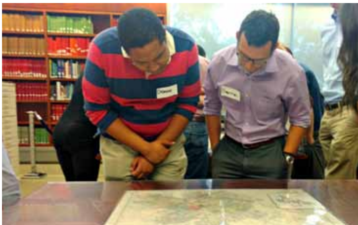
Junior Board members study one of 600,000 maps in the Library of Virginia's collection at a Junior Board young professional event.