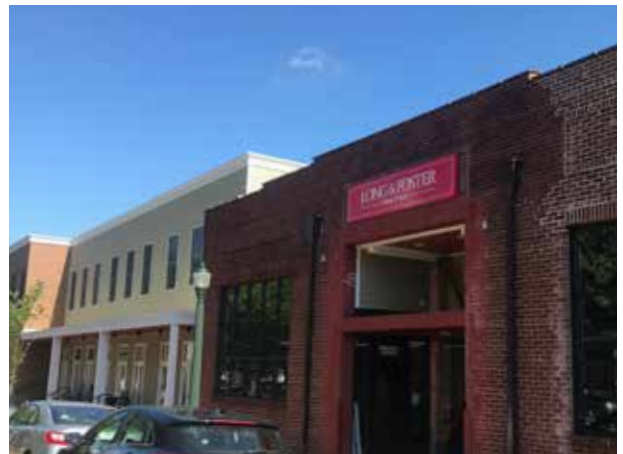
Patrick Henry Square 313 North 24th Street Neighborhood: Church Hill Owner | Developer: Sterling Bilder LLC Architect: Lawrence Group New York and Sebastian Quinn Design Studio Engineer: Draper Aden Associates Contractor: J.D. Lewis Construction Management