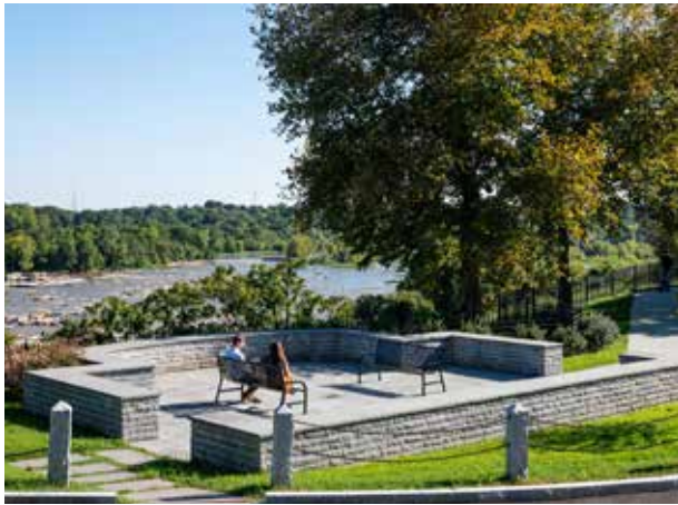
Hollywood Cemetery Improvements 412 South Cherry Street Neighborhood: Oregon Hill Architect | Landscape Architect: BCWH Architects Contractor: Messer Construction Co.