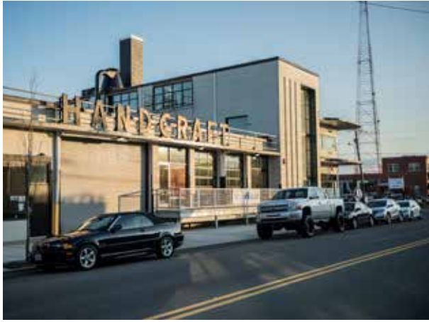
The HandCraft Building 1501 Roseneath Road Neighborhood: Scott's Addition Developer: Divaris Real Estate Architect: 510 Architects LLC Engineer: Lynch Mykens Contractor: Trent Construction Landscape Architect: H&A