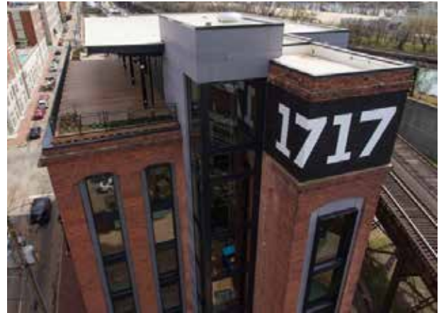
1717 Innovation Center 1717 East Cary Street Neighborhood: Shockoe Bottom Owner | Developer: Capital One, NA Architect | Designer: SMBW, PLLC Contractor: Gilbane Building Company Landscape Architect: Tillage Studio