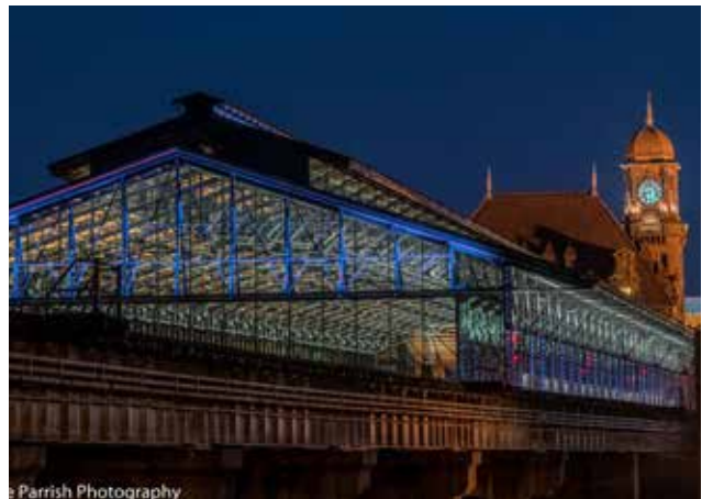
Main Street Station Train Shed Rehabilitation 1500 East Main Street Neighborhood: Downtown Owner | Developer: City of Richmond Architect: Beyer Blinder Belle and SMBW, PLLC Engineer: HCYU and Silman Landscape Architect: Timmons Group