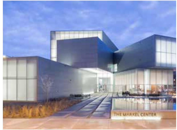
Institute for Contemporary Art 601 West Broad Street Neighborhood: VCU Architect: Holl Architects and BCWH Architects Engineer: Arup, Ascent Engineering Group, Silman, and VHB Contractor: Gilbane Building Company Landscape Architect: Michael Boucher Landscape Architecture