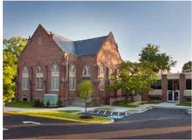
St. Bridget Middle School 6112 Three Chopt Road Neighborhood: West End Developer: St. Bridget School Architect | Designer: WHHA +Ionic DeZigns Studio Engineer: Dunbar Milby Williams Pittman & Vaughn, Inc. Contractor: KBS Landscape Architect: VHB Tax Credit Consultant: Sadler & Whitehead Architects