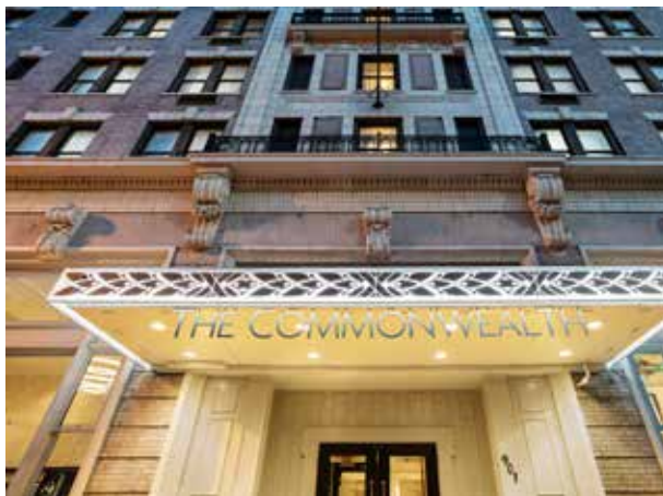
The Commonwealth 901 Bank Street Neighborhood: Downtown Developer: SMI Hotel Group Architect | Draftsman: Baskervill Design Engineer: RTB Engineering Contractor: M. L. Bell Construction Tax Credit Consultant: Sadler & Whitehead Architects