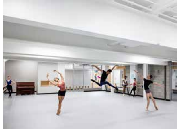
Richmond Ballet Renovation 407 East Canal Street Neighborhood: City Center Owner | Developer: Richmond Ballet Architect | Interior Design: 3north Engineer: DMWPV and Lu + Smith Contractor: Conquest Moncure & Dunn, Inc.