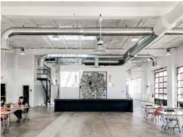
Studio Two Three Expansion 3300 West Clay Street Neighborhood: Scott's Addition Owner | Developer: Studio Two Three Architect: LoCh Design Engineer: Balzer & Associates, ONeil Engineering Services, and Tribble Electric, Inc. Interior Design: Campfire & Co.