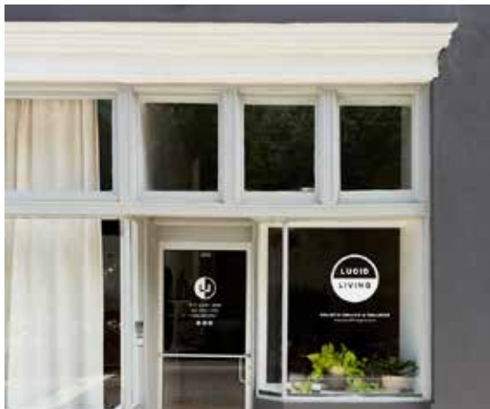
Lucid Living 300 East Grace Street Neighborhood: City Center Owner: 300 East Grace LLC Architect: Walter Parks Architects Contractor: UrbanCore Construction Interior Design: Campfire & Co.