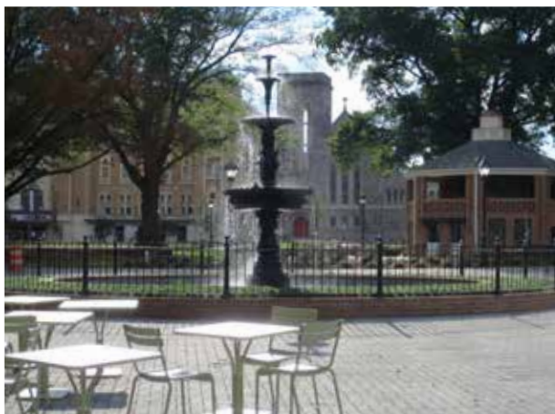
Monroe Park Renovation 719 West Franklin Street Neighborhood: VCU Owner | Developer: City of Richmond, Monroe Park Conservancy Landscape Architect: 3north