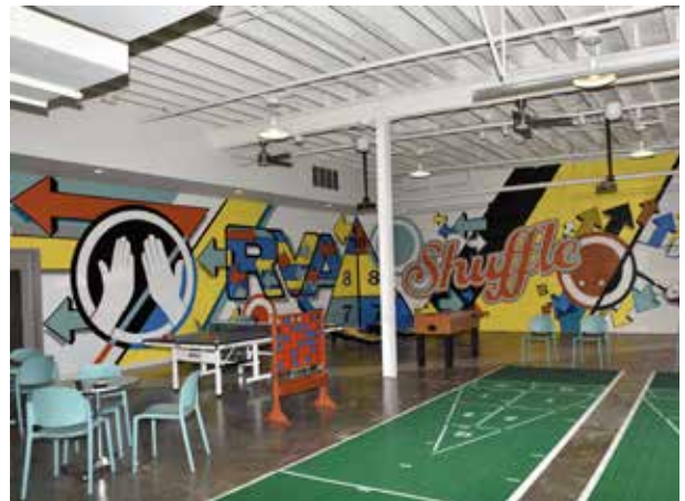
Tang & Biscuit Shuffleboard Social Club 3406 West Moore Street Neighborhood: Scott's Addition Owner | Developer: T & B Partners LLC Architect: 510 Architects Contractor: Commonwealth Construction Management (CCM)